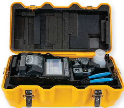
Workstation in Transit Case

Backed by the best service team in the industry, the Fujikura 41S is the ideal splicer to use when portability, ruggedness, and reliability are needed for your splicing application.