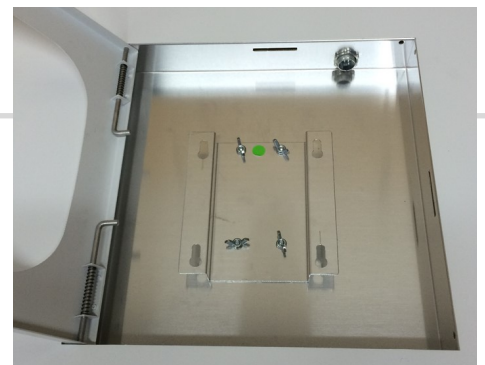
Integrated Mounting Plate, Cord Grip and Repositionable Door